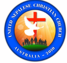
United Nepalese Christian Church