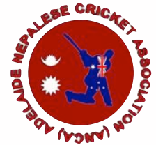
Adelaide Nepalese Cricket Association