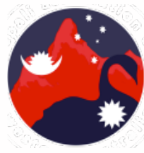
Nepalese Association of Western Australia