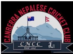
Canberra Nepalese Cricket Club